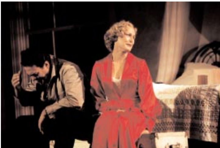
Robert Pastorelli, Glenn Close

Williams grew up during the Depression, flirting with radical politics and regarding himself as something of a 'revolutionary'. He was drawn to theatre that addressed the concerns of the world. Theatre was no longer a place to be simply entertained, when on the streets people were homeless and starving. He debated political corruption, rarely voted, denounced America's war involvements and, as a homosexual, found himself harassed and threatened in a brutal world. A world without freedom to speak one's mind and to be the person one wants to be.